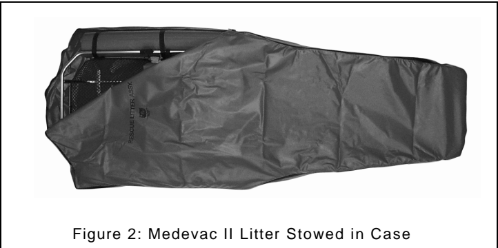
Figure 2: Medevac II Litter Stowed in Case