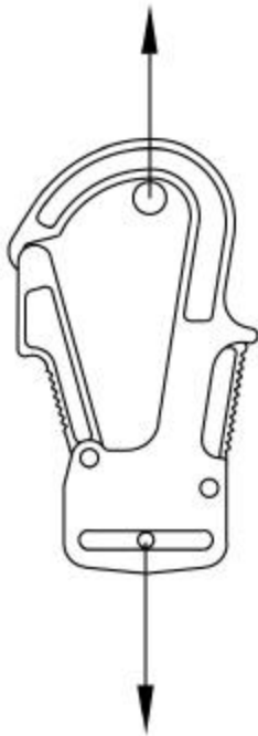
Straight Pull Only