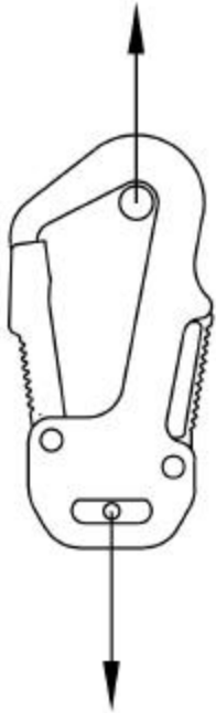
Straight Pull Only