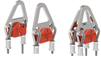
#193 Magnetic Attachment