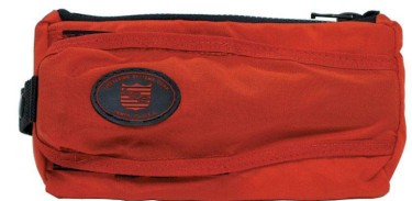
481-P Survival Equipment Pocket