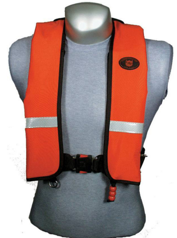
481-O Manual Pro Lite Vest